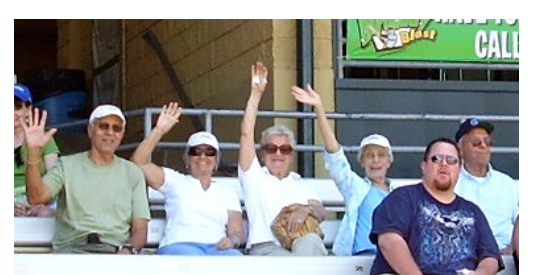
Kane County Cougars "Go Team"