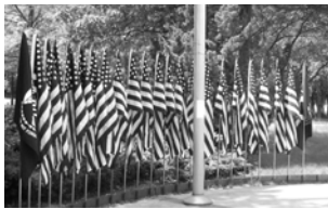
Remember Our Veterans Veterans Day November 11th